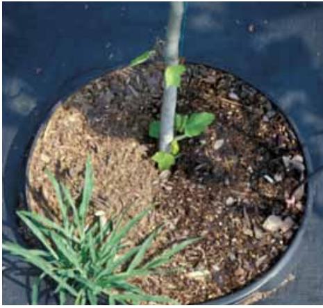
Figure 5a. This single-irrigation emitter is not supplying water to the entire root system of this 15-gallon container. A different type of emitter, more than one emitter and/or different emitter placement is needed.

and larger container sizes (Figures 5a, 5b). Microemitters include microsprinklers, drippers and bubblers. Microsprinklers, commonly called “spray stakes,” are the most common type of microemitter in nursery production. Sprinkler heads are mounted on a stake in the container. The sprinkler head/ stake assembly is connected to the lateral line by a small diameter (1/4”- 1/8”) flexible tube called spaghetti tubing. Drip emitters and bubblers are not used often in nursery production because they do not apply the water to the surface of the substrate evenly, a problem that compounds the larger the container size. Also, the single-point delivery of a drip emitter can lead to water channeling through the bark substrate due to its coarse nature.