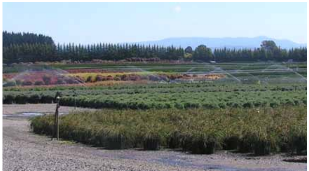
Figure 4. Overhead irrigation can vary significantly within an irrigation zone, across zones and over the course of a season.

Microemitters are emitters that apply a small volume of water at low flow rates, generally to individual plants. Microemitters are often used for 7-gallon