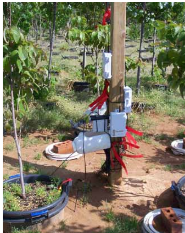
Figure 2. Capacitance probes are currently used by researchers and a limited number of growers to schedule irrigation.

Plant-based irrigation systems, such as leaf temperature-based, allow for environmental influence but do not account for root-to-shoot signaling and are challenging to automate. Plant-based systems can respond to the physiological changes that occur directly due to changes in plant water status, which make them very appealing to researchers and practitioners alike. However, this response can be a disadvantage for conservative irrigation schedules in certain environments, because low plant water status induced by extreme mid-day conditions could trigger irrigation when substrate moisture is not limiting. Leaf temperature, plant water potential and stem diameter fluctuations are some of the plant-based techniques that have been used to gauge water loss in horticultural crops (Figure 3). Plant-based systems are not automated easily or widely commercially available at this time.