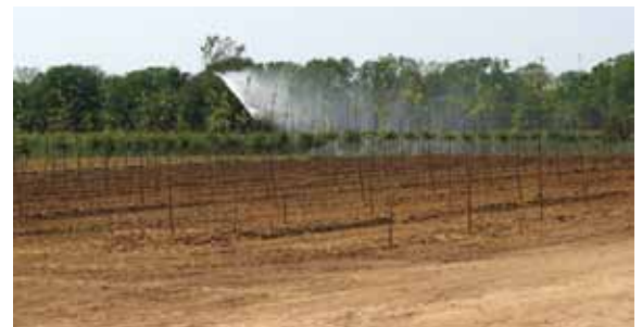
Figure 1. Often newly planted liners are the first plants to be irrigated.

Creating more efficient water-use systems can ease competition for water. Many factors contribute to overall irrigation system efficiency. Irrigation application efficiency is the proportion of total water applied that is intercepted and retained by the container (or root zone in the field). Water loss to excessive leaching, evaporation, wind, container spacing, canopy