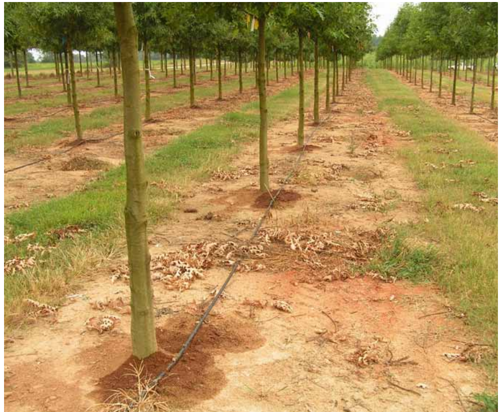
Figure 5b. Microemitters used in drip irrigation deliver water directly to the root zone, eliminating inefficiency due to evaporation and nontarget application (e.g., driveways, between pots).

Strategies to reduce water consumption in nurseries include grouping plants by relative water needs and container size and using cyclic irrigation. Grouping plants by perceived irrigation needs (high, medium, low) into irrigation zones is a common strategy employed by growers. Grouping plants by water needs along with proper spacing can reduce water consumption tremendously. Another conservative irrigation strategy is cyclic irrigation, in which the total daily volume of irrigation water is applied in multiple irrigation events with a minimum of one hour between irrigation events. Using cyclic irrigation can reduce runoff by 30 percent, compared with conventional continuous irrigation. Using