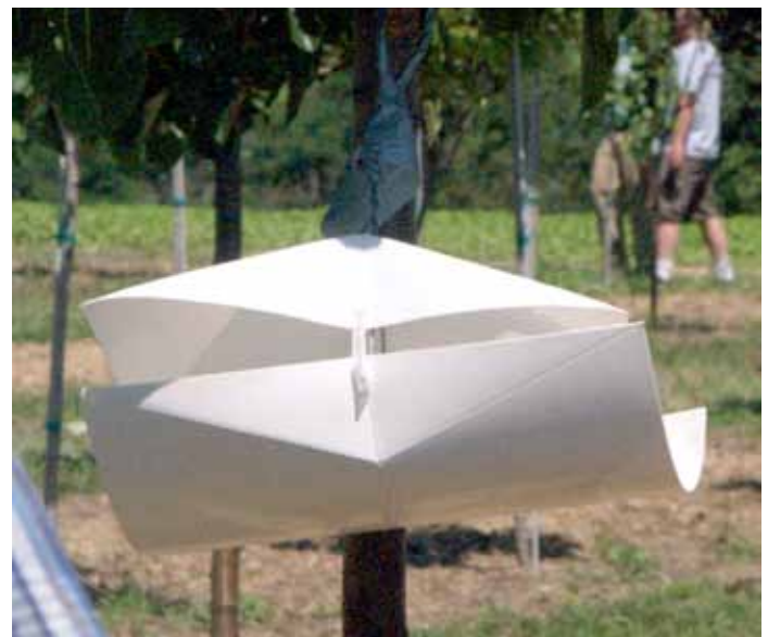
Figure 3. Wing traps with pheromone lures are useful for trapping clearwing moths.

Set traps according to the scouting schedule (Tables 1 and 2). Traps should be hung at 4-6 feet above ground