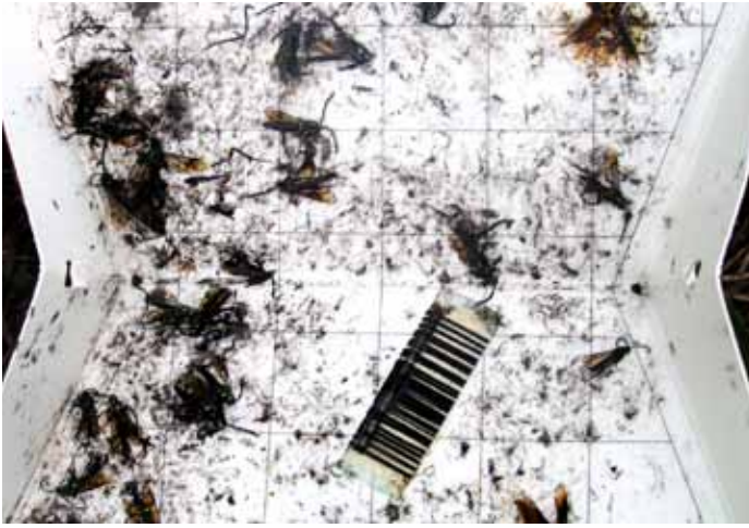
Figure 4. Inside of wing trap with the borers caught in it and the lure.

level in the nursery, but can be placed at the office or other convenient location nearby. Traps can also be hung from limbs of trees in the nursery if duct tape or another protective coating is used to prevent bark damage (Figures 3 and 4). For flatheaded appletree borer, use red sticky traps that mimic a tree-trunk shape (no lure). Use commercially available ultra-high-release lures for granulate ambrosia beetle to better attract the adult beetles. For clearwing borers (e.g., peachtree and lesser peachtree borers) use the commercially available lures (not interchangeable, as they are different isomers). Use one trap per insect species.