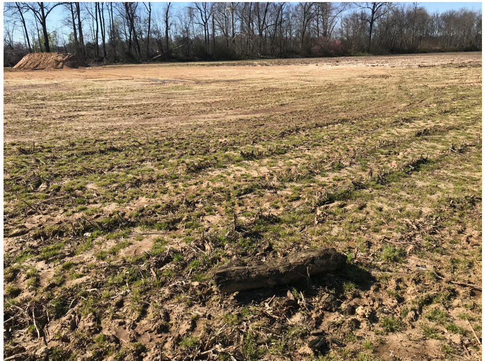
Figure 1. Milan Tennessee, Milan AgResearch and Education Center, a field location after spring flooding in 2019 left the area inundated with sand.

Biochar is composed of very resistant carbon that can persist in the soil for a very long time,