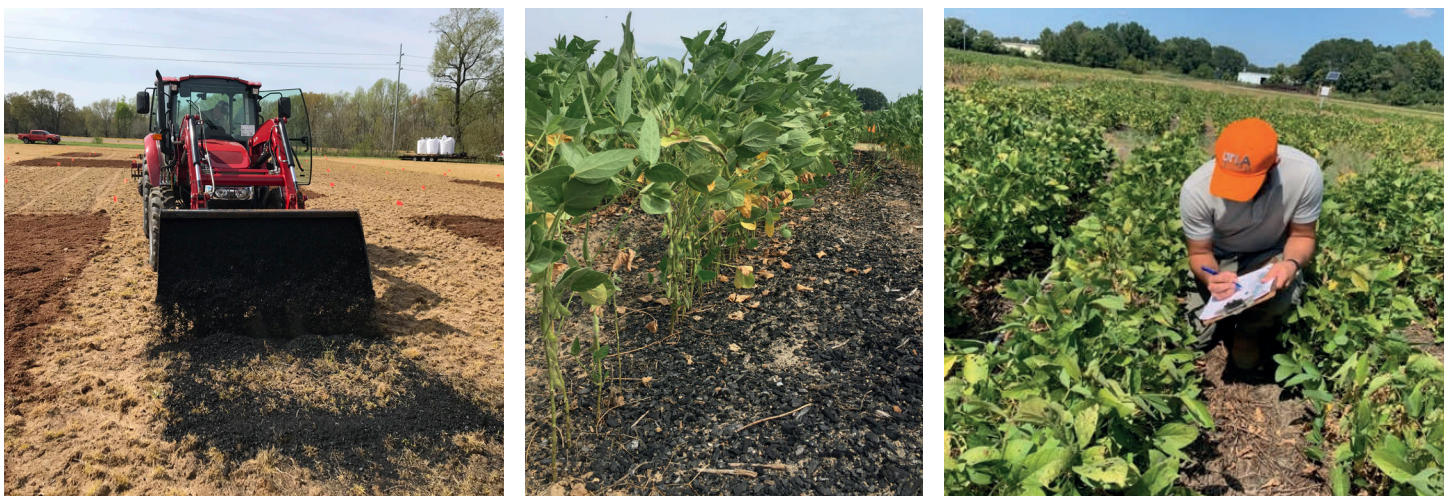
Figure 4. Biochar was surface-applied then lightly disked into the soil before planting soybeans.

Biochar was surface-applied in the field in early 2018 prior to planting soybeans. In the 2018 and 2019 seasons, soybean growth and development were monitored (Figure 4). Measurements taken during the growing seasons included soil bulk density; soil organic carbon; soil water infiltration; plant relative water content (RWC); visual rating for plant wilting (WS) on a 0 to 5 scale, with a score of 0 indicating no wilt and a score of 5 indicating complete kill; and final yield (two center rows were considered for yield). Applying 33.2 tons biochar per acre reduced the topsoil bulk density (from 1.6 to 1.1 g cm 3 ) and increased the total organic carbon. Water infiltration rates were significantly reduced with all rates of biochar, and soil moisture contents increased when biochar was applied at rates more than 8.3 tons per acre (taes.tennessee.edu/publication/show_pub.asp?pub=28778).