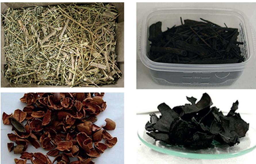
Figure 2. Biomass (left) and biochar (right) from big saltbush (top) and pecan shells (bottom). Photo credits: Catherine Brewer (top left), Kwabena Sarpong (top right), Jere Freeh (bottom left), and Jose Rodriguez (bottom right). aces.nmsu.edu/pubs/_circulares/CR690/welcome.html

so annual applications of biochar to agricultural fields are not recommended ( aces.nmsu.edu/pubs/_circulares/CR690/welcome.html ). Biochar has been used as an effective soil amendment for the improvement of soil nutrient and water management. Biochar is a carbon-rich, charcoal-like byproduct after biomass (wood, corn husks, poultry manure, etc.) is heated at high temperatures in the absence of oxygen (Figure 2). Biochar has lots of tiny spaces, or pores, that cause it to act like a “hard sponge” when it is in the soil. These characteristics contribute to its potential to improve soil water availability by absorbing and retaining water.