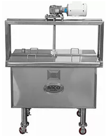
Figure 1. Cheese vat and drain table (Anco Equipment, 2021b)

Next, the cheese is pressed in one of two ways: 1) use the weight of cheeses stacked as the source of pressure and rotated occasionally, or 2) use a continuous pressing system (Figure 5). Curds are usually pressed for ~18 hours, but this time can be shortened by using a continuous pressing system.