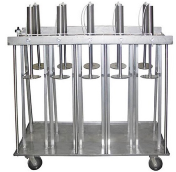
Figure 5. Vertical a-frame cheese press 10 head (Koss Industrial, 2021)

For more information about dairy processing and steps, please contact your local Extension agent or Dr. Eckelkamp at 865-974-8167 or eeckelka@utk.edu . More resources are also available on the UT Value-Added Dairy website . If you are considering a value-added dairy enterprise, be sure to reach out to the Tennessee Department of Agriculture about permitting and licensure.