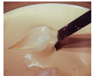
Figure 2. Proper curd test results (Wallace, 2018)