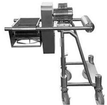
Figure 3. Cheese miller (Anco Equipment, 2021a)