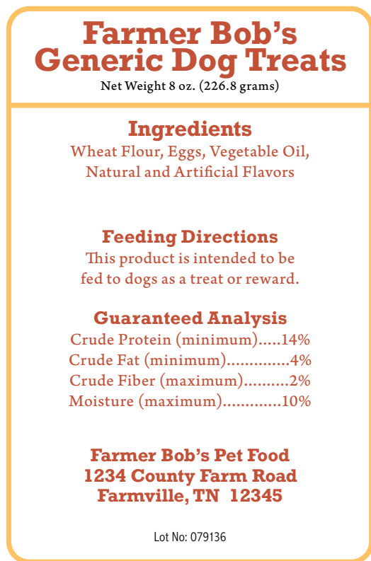
Figure 1. Example of Acceptable Pet Treat Label