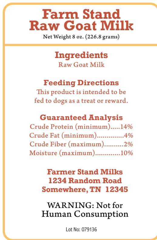
Figure 3. Example of Raw Milk Pet Treat Label