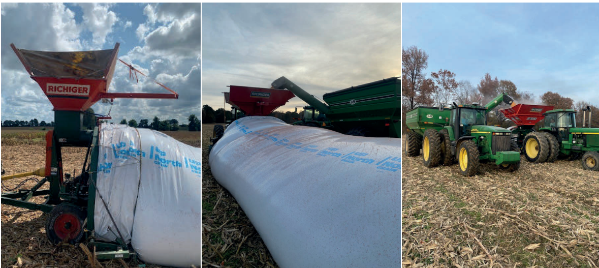
Figure 1. Grain bag loader.