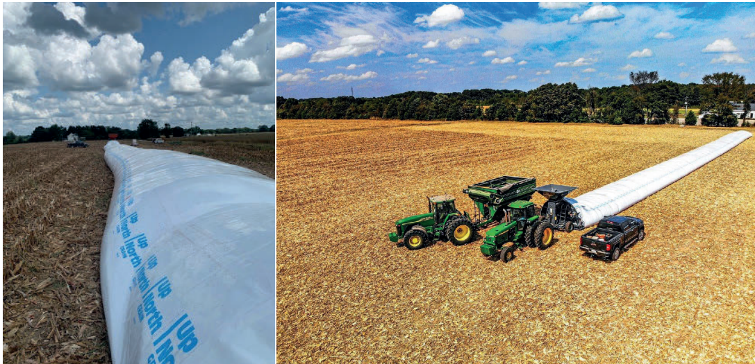
Figure 2. Storage bag at the edge of a corn field.

Grain bags are mainly used to store corn for six months or less. Higher moisture corn can be stored but this will increase the risk of losses and/or shorten the storage interval. Bags typically range from 10,000 to 18,000 bushels and cost 6 to 17 cents per bushel for the bag. To store grain in bags, a producer will need access to a tractor, grain bag loader (Figure 1), a grain bag unloader, and storage bags. Bags can be filled at the field's edge or in a centralized location. However, bags should be filled in straight rows (Figure 2), in a location with no standing water/adequate drainage and that has a relatively moderate slope. When filling grain bags, attention needs to be paid to the location, as access during winter can be problematic if field conditions change. Filling bags in a straight line will make unloading the bags easier.