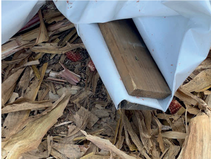
Figure 3. Sealing grain storage bags using a 1-by-4 and screws.

To unload a bag, a producer will need a grain cart (or truck if field conditions permit) operator and an unloader operator. The unloader operator will drive the unloader down the bag. The unloader has a blade that cuts the bag open, allowing the grain to fall into an auger that runs into the grain cart or truck. The whole bag will need to be hauled off after being opened as resealing an opened bag can be problematic. Once a bag is unloaded, many producers will use poly pipe rollers to roll up the used bag for disposal. Bag disposal practices and costs will vary depending on the location.