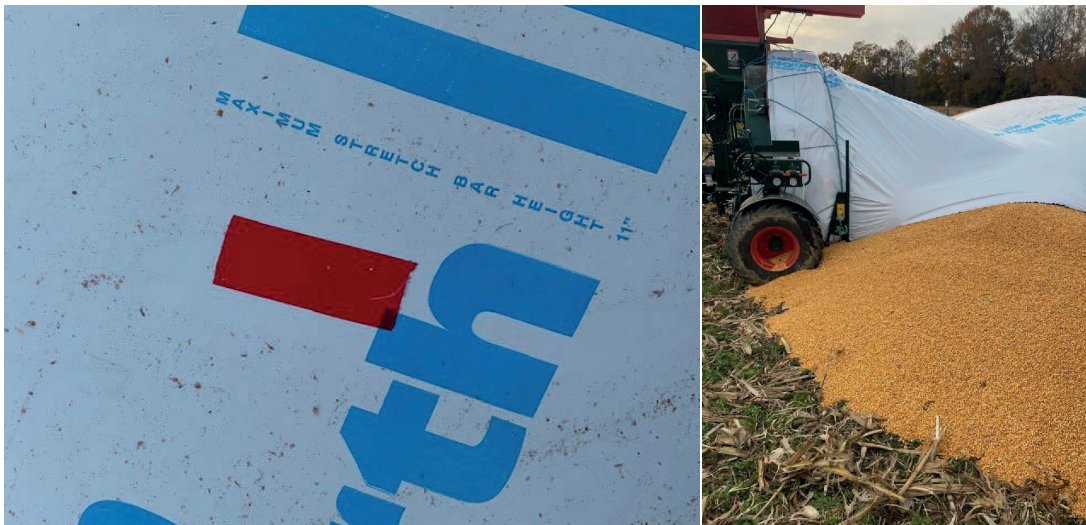
Figure 4. Ensuring a bag is not over or under filled.

To unload a bag, a producer will need a grain cart (or truck if field conditions permit) operator and an unloader operator. The unloader operator will drive the unloader down the bag. The unloader has a blade that cuts the bag open, allowing the grain to fall into an auger that runs into the grain cart or truck. The whole bag will need to be hauled off after being opened as resealing an opened bag can be problematic. Once a bag is unloaded, many producers will use poly pipe rollers to roll up the used bag for disposal. Bag disposal practices and costs will vary depending on the location.