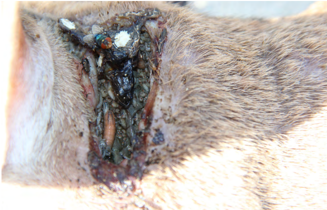
Figure 2: Close-up of a New World screwworm female fly, eggs, and larvae on an animal's wound

There is concern that the outbreak could further expand into the U.S., primarily due to the movement of animals including cattle in Mexico and across the border into the U.S. This parasitic fly is particularly devastating because the larvae (maggots) feed on the living tissue of their host. Females are attracted to open wounds where they lay their eggs (e.g., cuts, scrapes, tick bites, castration, dehorning, branding, ear tagging, or healing umbilical cords of newborn animals) (Figures 2 & 3). The eggs hatch and the larvae bore into animal tissue and feed on living flesh, expanding the wound. Infested wounds are very attractive to ovipositing (egg-laying) females, resulting in the deposition of additional eggs, enlargement of the wound and eventually, death of the host. All warm-blooded animals are at risk, including livestock, pets, wildlife, and humans.