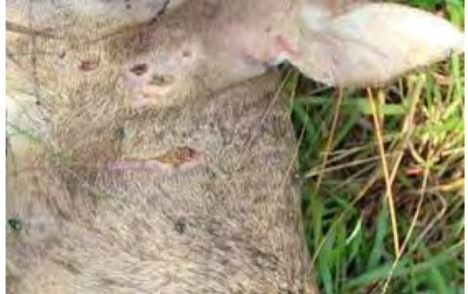
Figure 3: New World screwworm infestation lesions on a Key deer