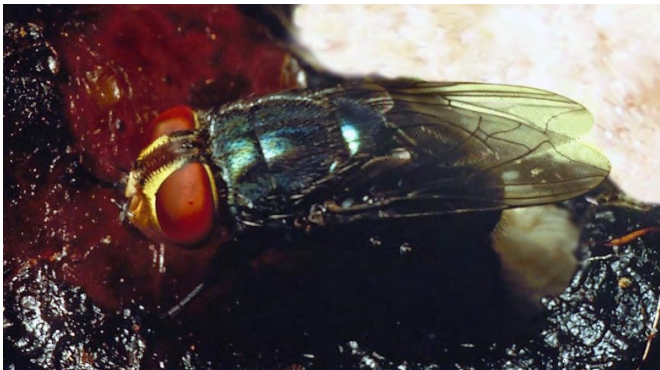
Figure 1: Close-up of a New World screwworm fly and egg mass on a wound

The New World screwworm (NWS) is a species of blow fly in the family Calliphoridae (Figure 1). Also known as the primary screwworm ( Cochliomyia hominivorax ), this fly received its common name because of its larval (maggot) stage's feeding behavior in which they cause extensive damage to the living tissue of warm-blooded animals using their sharp mouth hooks to burrow into their host, similar to a screw being driven into wood. This pest is endemic in many Caribbean islands and South America. Historically, its range extended into the southern U.S., through Mexico and the Caribbean, and into South America. Control and eradication efforts removed screwworm from North and Central America, and several Caribbean islands.