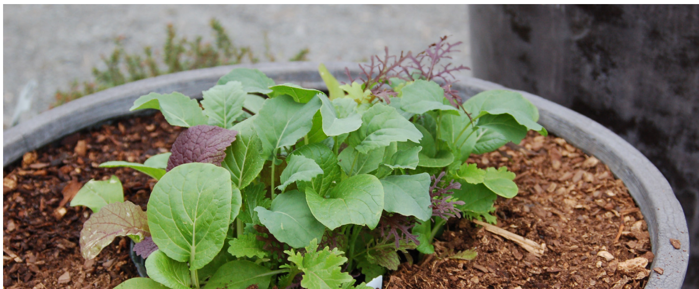
A leafy mix with bok choy, mustard, and mizuna grown as a baby leaf crop in a large decorative container.