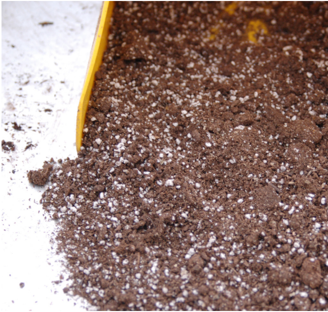
A greenhouse germination mix with peat and small perlite. This mix would hold water too well for most plants grown in a container. A greenhouse mix with larger perlite would be better suited to container growing.