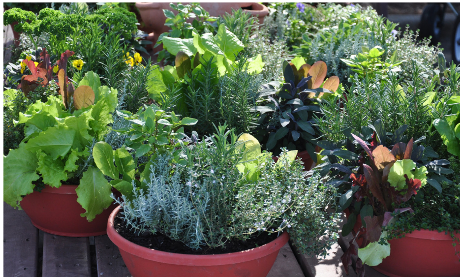
When properly sized and well managed, containers can be a great tool for home food production. This array of containers is visually appealing but will likely require frequent management due to the dense planting of crops and small size of the containers.