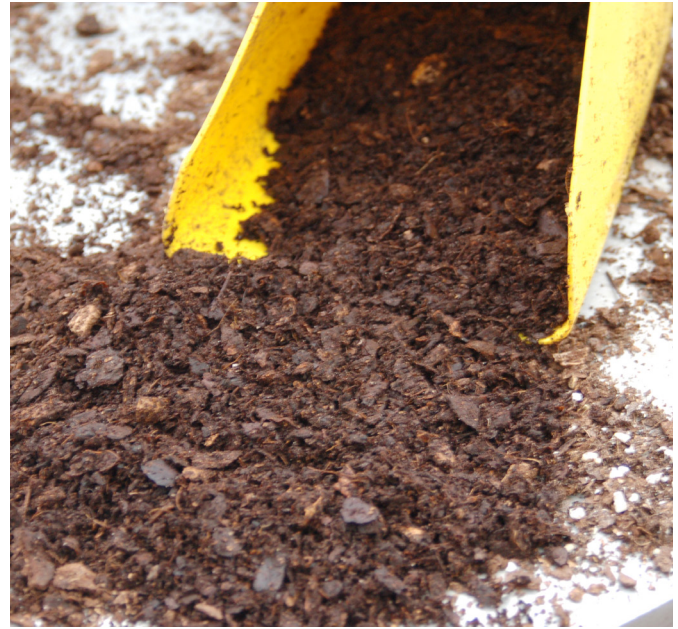
A nursery type mix with a high percentage composted pine bark. While this would be a good material to be used in a mix, if used alone, it would dry out quickly.