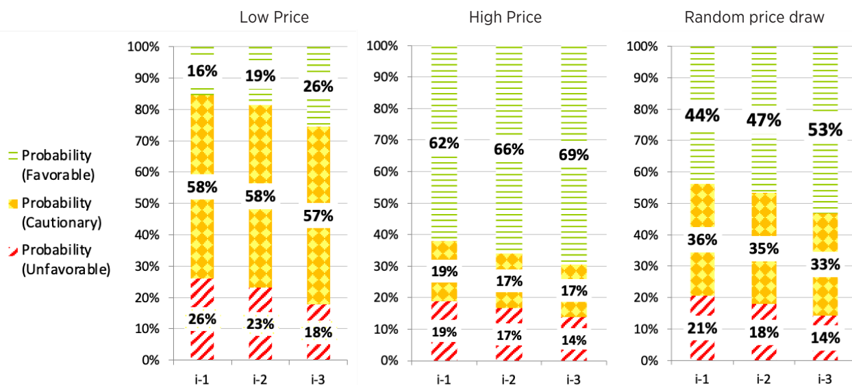
Figure 2. Probability of having partial net returns, compared to rainfed production, of less than $0, $0 to $100/acre or greater than $100/acre compared to rainfed for irrigation treatment by price.