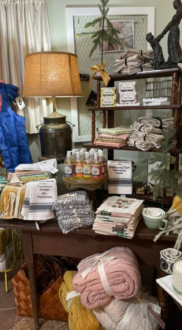
Complementary products are offered at an on-farm retail shop. RiverView Farm Market, Knoxville, Tennessee.