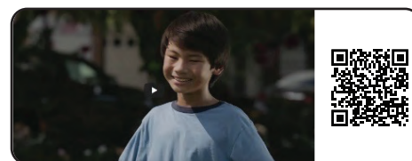
Move Your Way: Tips for Getting Active as a Family