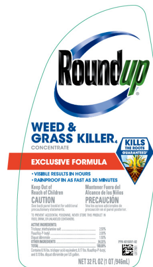
Image 1. Roundup-branded herbicide that does not contain glyphosate available to consumers in 2024.

While these changes will be reflected on product labels, consumers who have used Roundup-branded herbicides for many years may not immediately recognize these changes or understand the importance of reading and reviewing labels before use. Failure to follow label directions may undermine efficacy and increase the likelihood of off-target movement and associated risks.