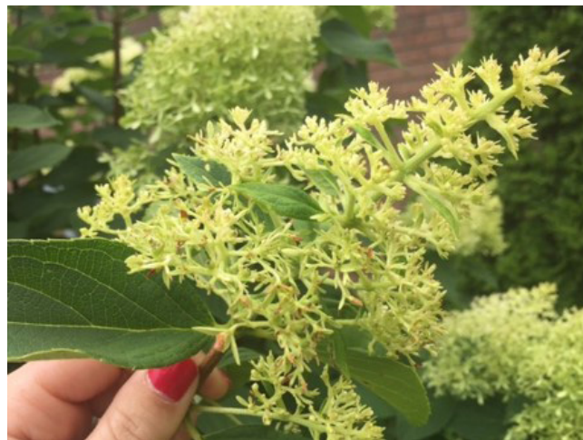
Image 4. Damage to Hydrangea paniculata bloom showing distorted flower formation from use of Roundup® Extended Control (glyphosate + imazapic + diquat) as an edge treatment for weed control in the landscape bed when the homeowner had thought they selected a glyphosate-only Roundup® product.