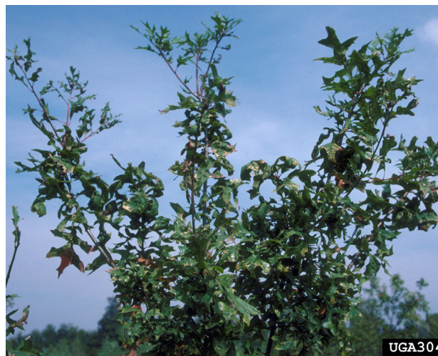
Image 3. Young oak tree ( Prunus spp.) showing damage from nearby use of the herbicide triclopyr (WSSA #4).

Pelargonic acid is a non-selective herbicide used for broad-spectrum control of green vegetation including broadleaf and grassy weeds, as well as mosses. Pelargonic acid is a contact herbicide. It does not translocate and only burns treated tissue via an unknown mechanism (WSSA Group #0). Acute toxicity of pelargonic acid is low ( LD_{50} > 5000 mg/kg); however, it can be volatilized after application. Pelargonic acid is not persistent in soil .